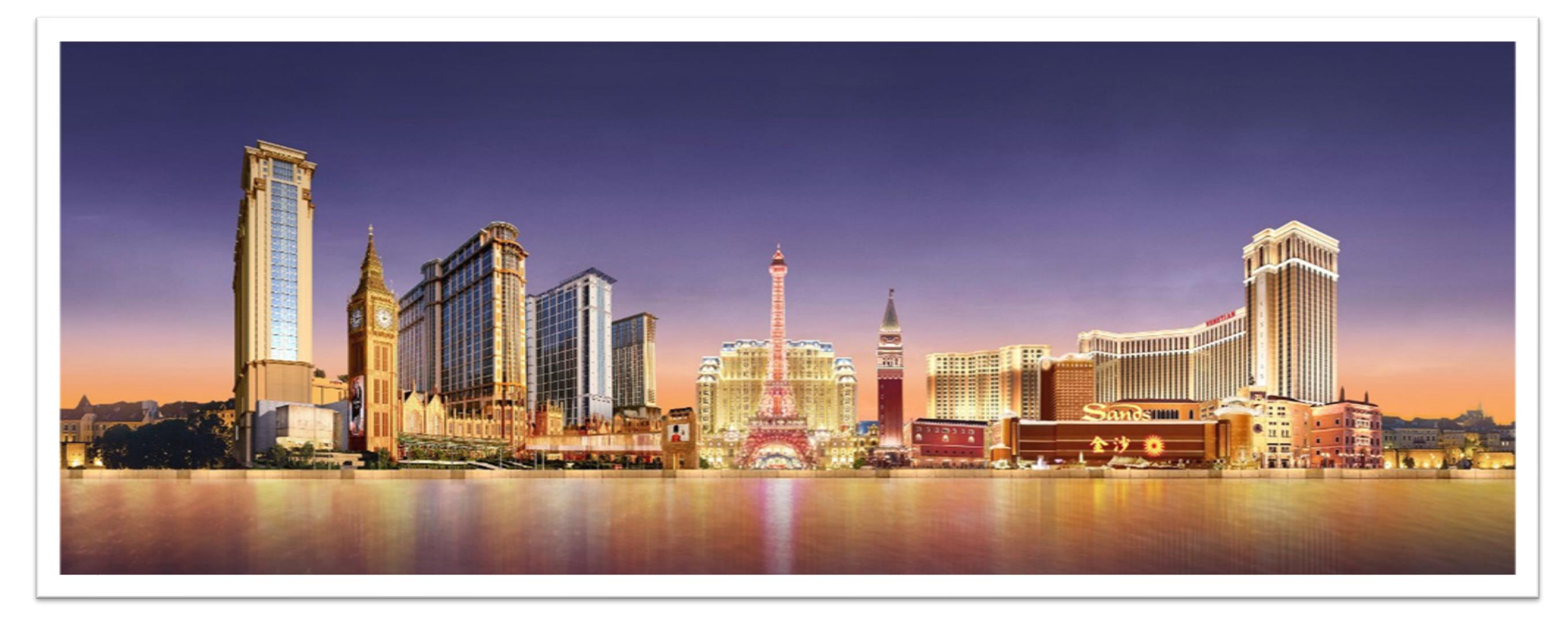
Photo caption: Sands China Ltd. (HKEx: 1928) is the leading developer, owner and operator of multi-use integrated resorts and casinos in Macao consists of Sands® Macao, The Venetian® Macao, The Plaza® Macao, The Parisian Macao, and The Londoner® Macao

• Nurturing and developing hospitality professionals, not only amongst our own employees, but extended to fellow allied workers, especially in the Macao retail industry, with the ultimate goal to support the development of Macao Tourism Industry to be the "World Centre of Tourism and Leisure"