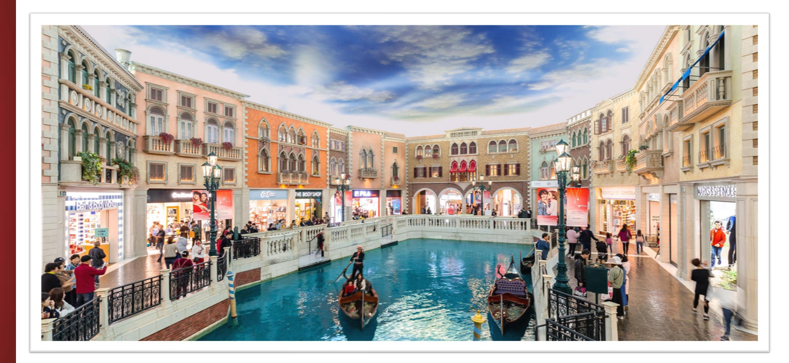
Photo caption: Complete with serenading gondoliers and colourful Venetian streetscapes, Shoppes at Venetian is a one million square feet indoor lifestyle mall at The Venetian Macao, with more than 360 stores featuring world-renowned brands that vary from street fashion to couture. They include Muji, UNIQLO, Zara, Marks & Spencer, Aape by the Bathing Ape, Polo Ralph Lauren, Victoria's Secret, Atrium, DFA, Rimowa and Rolex, as well as a wide selection of lifestyle choices covering fashion, technology, jewellery and accessories, plus over 30 restaurants and an extensive food court.