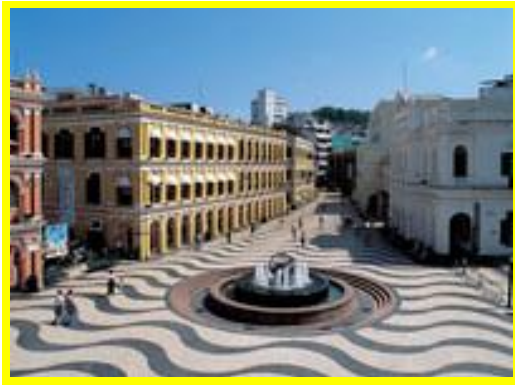
The Senado Square