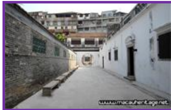
The Mandarin House