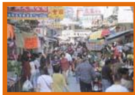
Local residents shopping area