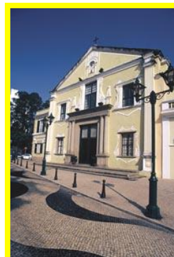
St. Augustine Church