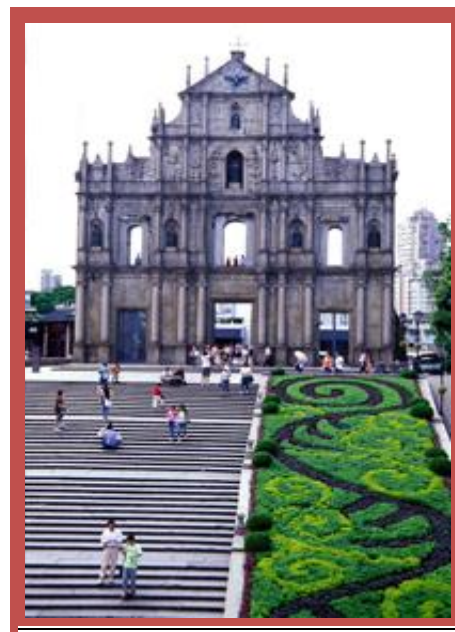
The Ruins of St. Paul's