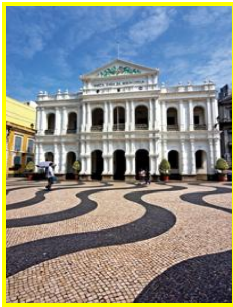
The Holy House of Mercy

Booking deadline One day before departure