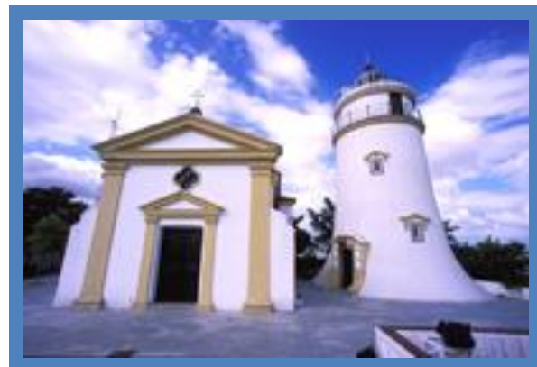
Guia Fortress and Chapel