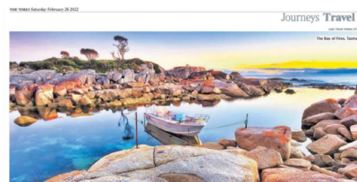
Hiking in Australia's healing lands

A Valley in Bloom Tourism Authority of Thailand, Thailand