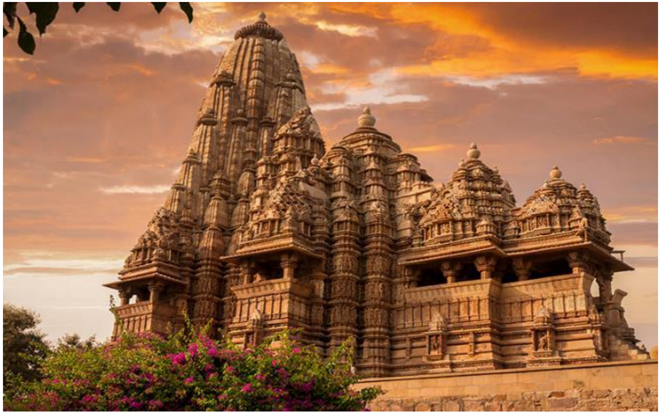
Temple, and the Shantinatha Temple, dedicated mainly to Jain teachers (Tirthankaras). These temples are ornately carved on the outside, with beautiful figures of Hindu Gods and Goddesses.

Eastern Groups of Temple - Visit Eastern Group of Temples includes the Parsvanatha Temple, the Adinatha